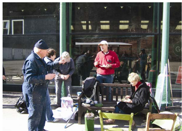
The Working Party ?