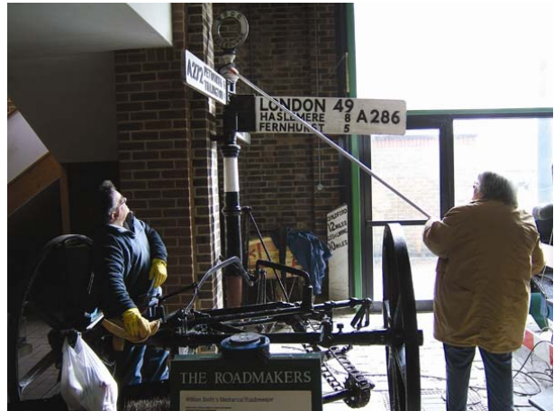
Over there please !