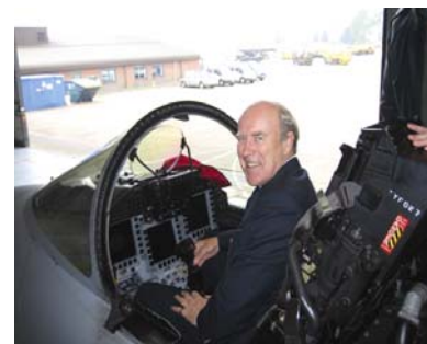
New Master at the controls