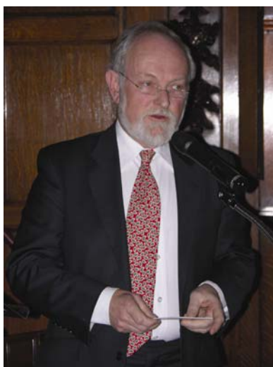
Guest Speaker Richard Stilgoe recites his poem during at Cutlers' Hall Installation Dinner